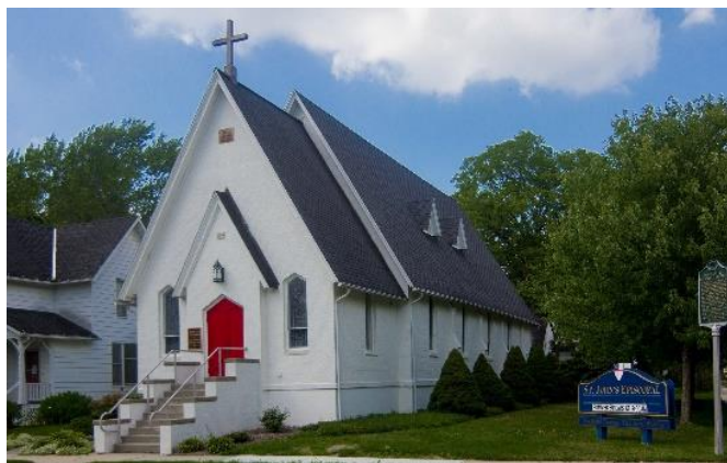
Saint John's with Old Rectory on the left.

We are known as the church "with the red doors," indicating all are welcome here. St. John's was registered in 1972 with the State of Michigan's Historical Marker Program and was placed on the National Register of Historic Places in 1982.