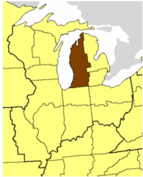
Diocese Area of Coverage

The Episcopal Diocese of Western Michigan is located at 5347 Clyde Park SW, Wyoming, Michigan, 49506, a suburb of Grand Rapids.