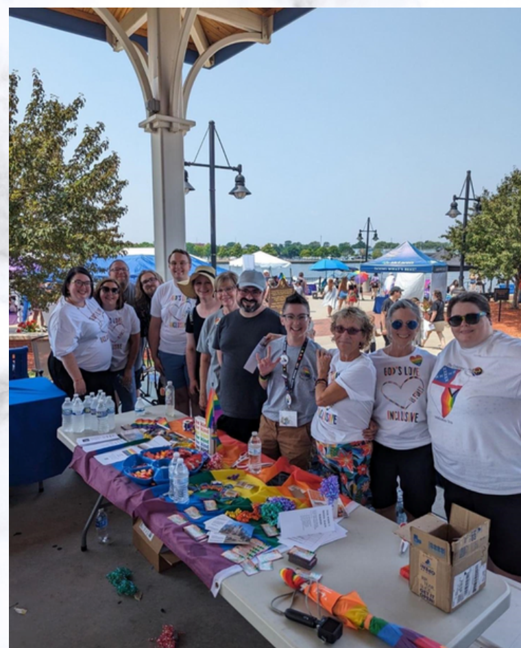
The booth shared by St. John's, Mt. Pleasant; St. Alban's, Bay City; Trinity, Bay City; and St. John's, Saginaw.

Some folks gave the gift of their presence at two Pride events – one locally and one in Bay City.